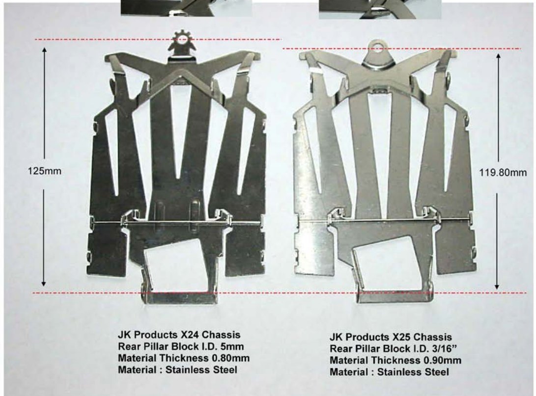
JK Products X24 Chassis Rear Pillar Block I.D. 5mm Material Thickness 0.80mm Material : Stainless Steel